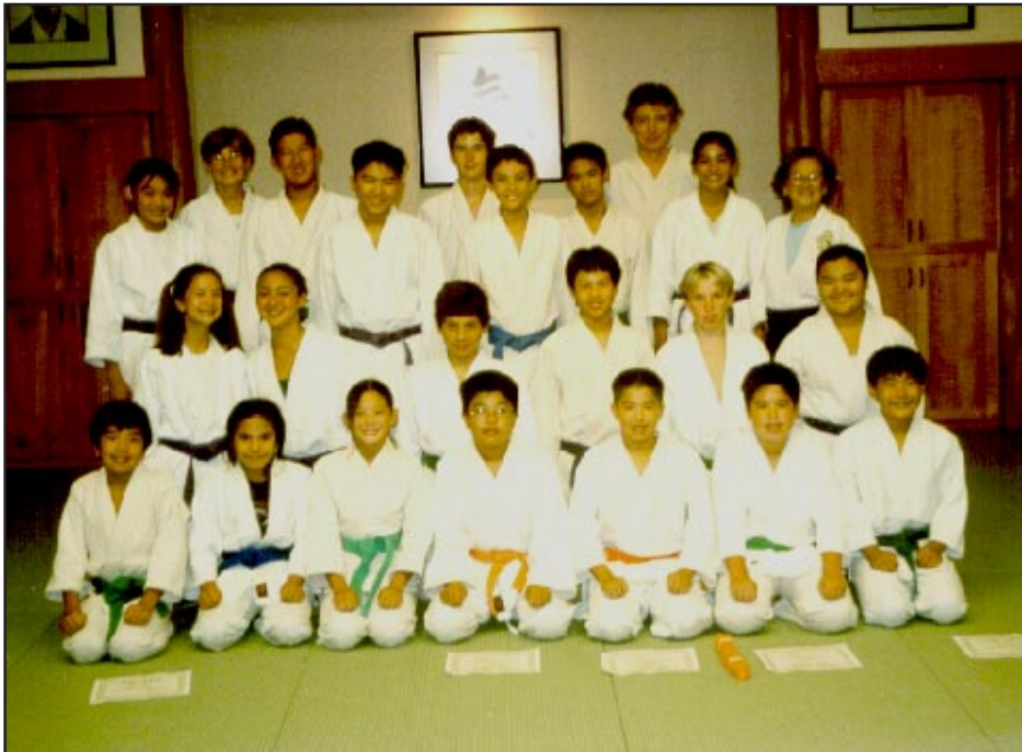
Maui Ki-Aikido’s advanced children’s class has just received a number of younger students who were recently promoted in the September 23 to 28 testing. Students of 5 th to 2 nd kyu, along with those 6 th grade and above in school, train together in the Thursday Intermediate and High School Aikido Class.

However, the children are learning not only a martial art but also the accompanying etiquette. This includes observing courtesy and respect for one’s teacher and one’s training partners on the mat. Aikido training also promotes self-confidence and a non-competitive release of youthful energy. Ki-Aikido’s goal is to train and develop the whole person and to instill healthy and wholesome values which remain with the student outside of the dojo and even beyond their actual training.