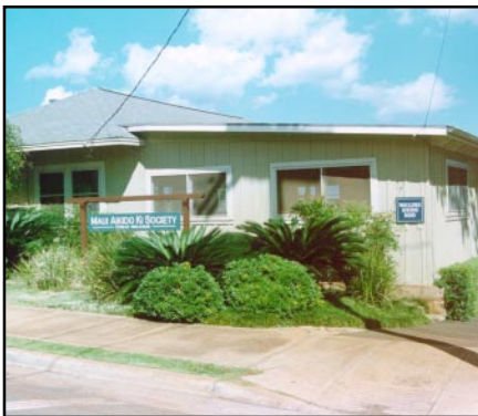
The old Maui dojo, on the site of the present Shunshinkan Dojo, was demolished in 1999.